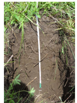
Figure 3. Mountain Loam Ecological Site