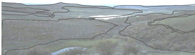
Figure 5. Rangeland Depicting Different Types of Land Based on Visual Clues in Aspect, Topography and Vegetation.