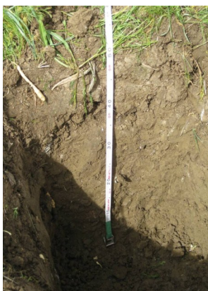
Figure 2. Claypan Ecological Site

plant associations or “states” that may exist on a given ecological site and how other site characteristics, such as hydrology and soil stability, might change with them. STMs describe the environmental conditions, disturbances and management actions that cause vegetation to change from one group of plant species to a different set of species, and the management actions needed to restore plant communities to a desired composition. STMs help you identify where your land is currently (its present state), suggest potential alternative states, and provide ideas about how to move to a more desirable state and avoid unwanted transitions.